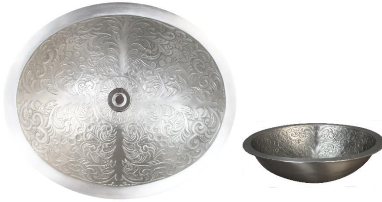
Shown in WB