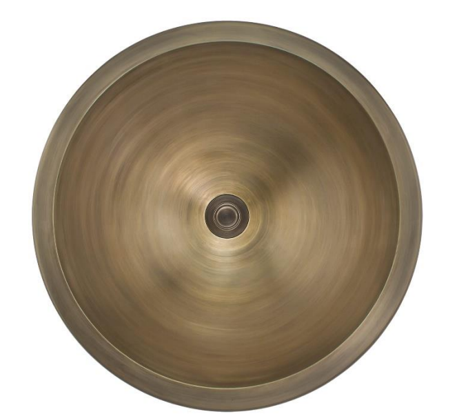
SHOWN IN AB