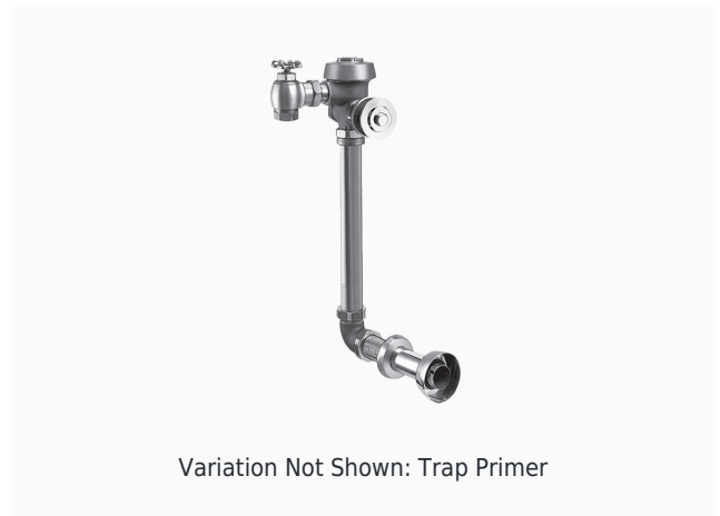
Variation Not Shown: Trap Primer