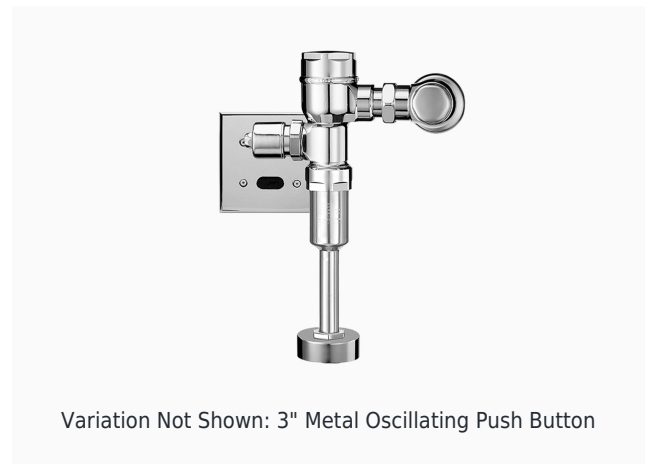
Variation Not Shown: 3" Metal Oscillating Push Button