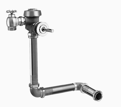
Variation Not Shown: 1" Straight Control Stop